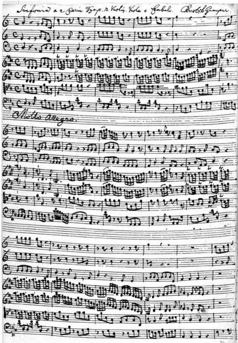
Christoph Graupner: Sinfonia in D Major, bars 1-17 (D-DS 470/95). Universitäts und Landesbibliothek, Darmstadt, Germany