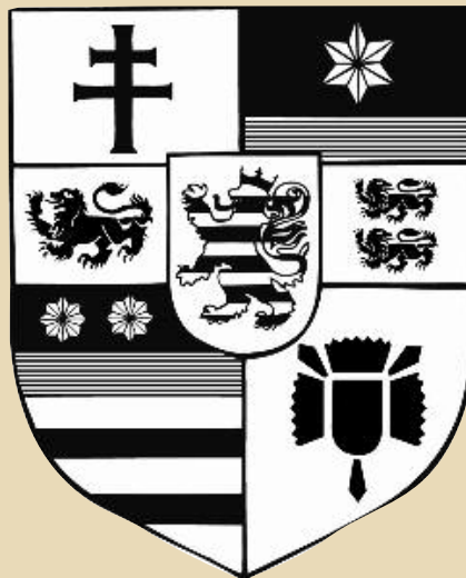
Ernst Ludwig's coat of arms.

By 1717, the loss of a subsidy forced Ernst Ludwig to close the opera house with deep reductions in the Kapelle , and those that remained were forced to live with irregular salary payments. Graupner, who had a wife and several children, found these working conditions intolerable.